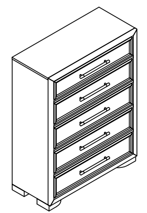
27165 5 Drawer Chest